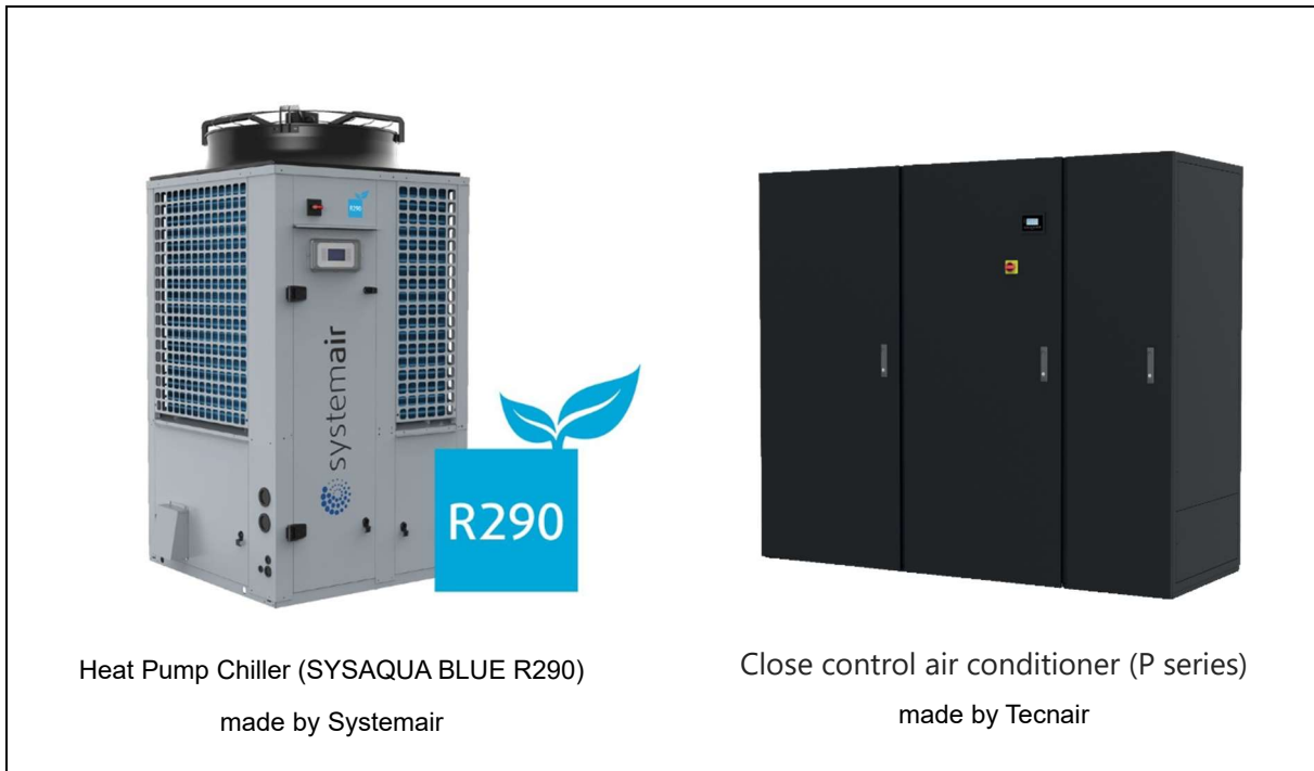
Heat Pump Chiller (SYSAQUA BLUE R290) made by Systemair