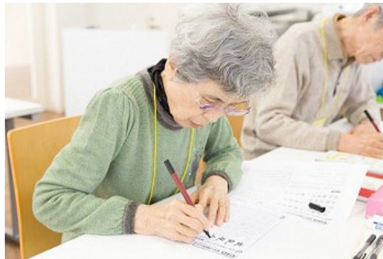
Gakken Brain Booster Classes