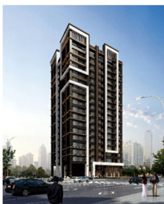
Perspective drawing of completed Sanchong Zhongxing Bridge Project (tentative name)

In addition to its close proximity to the city center and ample future potential, the site offers a living environment surrounded by greenery with the Tamsui River and Taipei Metropolitan Park only a short distance away. Moreover, the project plans to add originality and ingenuity unique to these industry-leading companies given their strong track record in Japan and overseas, including a Japanese-style color selection plan, periodic after-sales services, and the installation of Panasonic's smart condominium system.