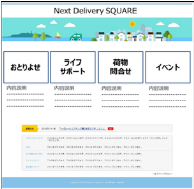
[Website page sample]