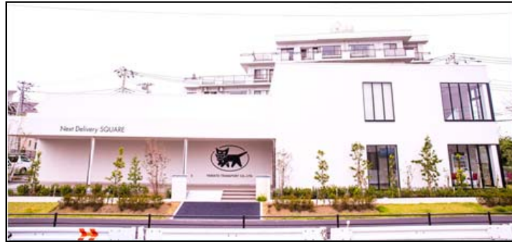
Next Delivery SQUARE.